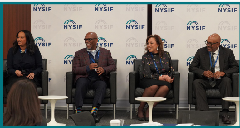
The “ Building a NYSIF Relationship ” panel explored what makes value propositions compelling and how MWBE firms can successfully navigate the allocation process.