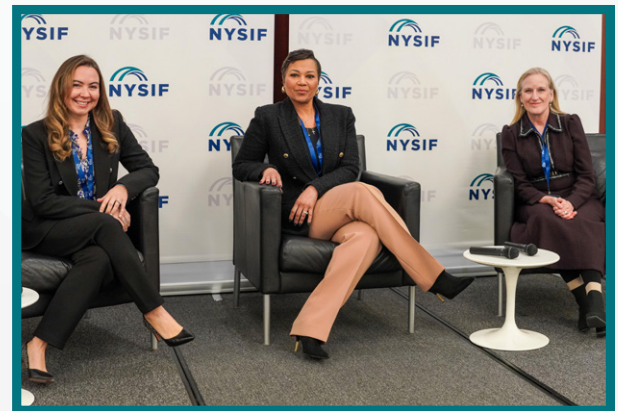
The “ How Open Are You to Innovate Non-conventional Investment Platforms? ” panel covered building relationships and creating pathways to opportunity for MWBE-certified businesses.