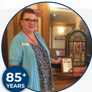
Leo House for German Immigrants New York, NY