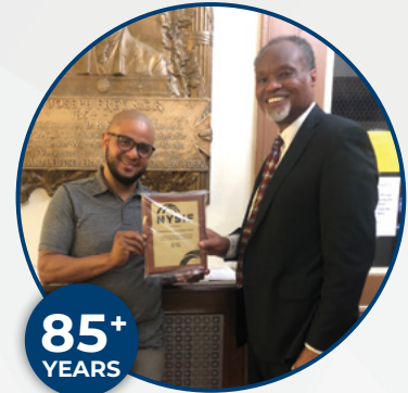
Catholic Kolping Society of New York New York, NY