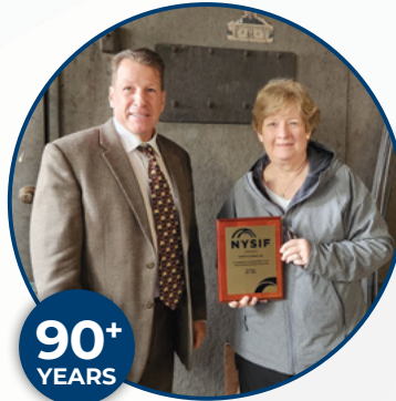
Wolff & Dungey, Inc. Syracuse, NY