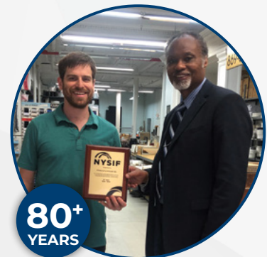
Steinlauf & Stoller, Inc. New York, NY