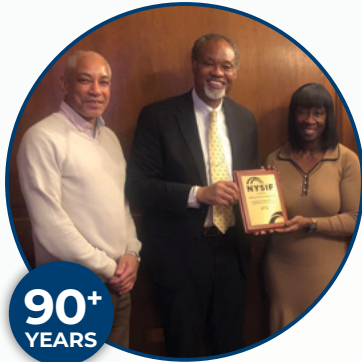
American Museum of Natural History New York, NY

We are honored that our commitment to redefining excellence and providing outstanding service to our policyholders has helped us earn their continued trust and ongoing business for generations.