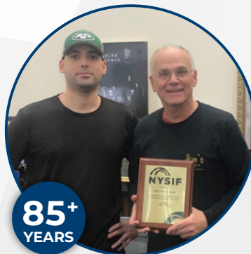
Jim's Shoe Repair New York, NY