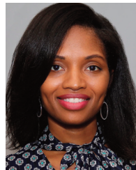
Nathaalie Carey Executive Deputy Commissioner NYS Department of Labor*