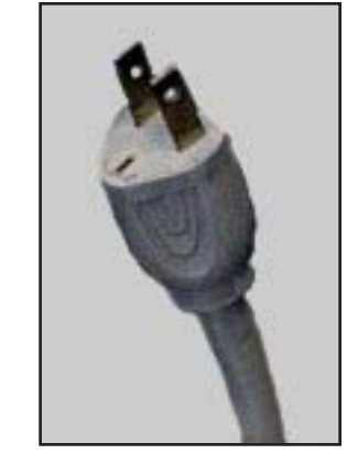
Removing the ground pin from a plug to fit an ungrounded outlet is an electrical hazard that could lead to shock or fire.