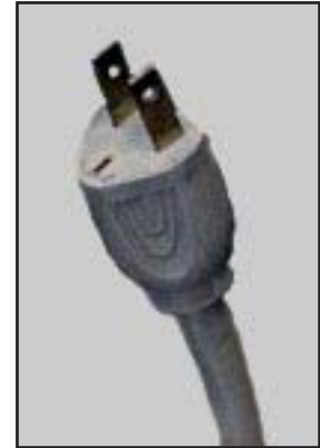
Removing the ground pin from a plug to fit an ungrounded outlet is an electrical hazard that could lead to shock or fire.