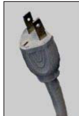
Removing the ground pin from a plug to fit an ungrounded outlet is an electrical hazard that could lead to shock or fire.